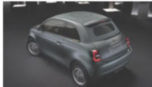
Giorgio Armani Designs a One-Off Fiat 500 March 4, 2020 In "Fashion"