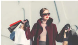
Giorgio Armani Makes Donation to Fight Coronavirus in Italy March 8, 2020 In "Fashion"