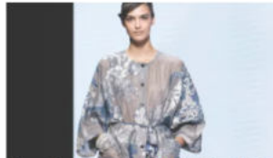
Giorgio Armani RTW Spring 2021 September 27, 2020 In "Fashion"